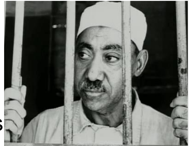
Sayd Qutb in prison