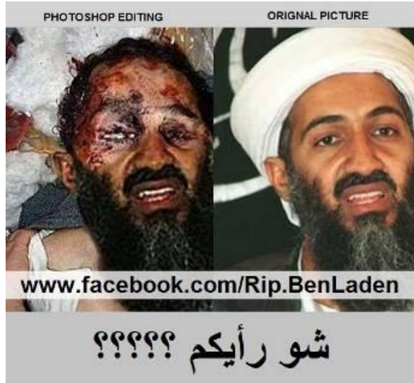
A photograph posted by one of the members registered to said Facebook page