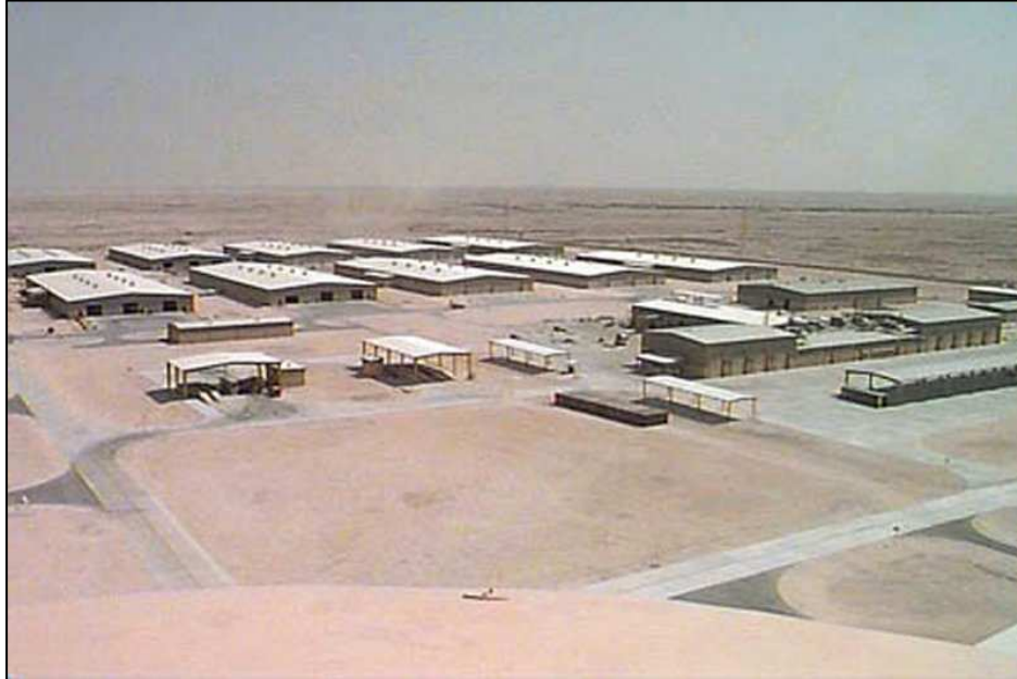
Installations of As-Sayliyah base

American diplomats and security officials are an additional target. In February 2009, another surfer in the Al-Faloja forum called for the Mujahideen in Somalia, Saudi Arabia and the Magreb region, to kidnap American diplomats or security officials worldwide and exchange them with Sheikh Omar Abdel Rahman, who has been incarcerated in the United States since 1993. 3