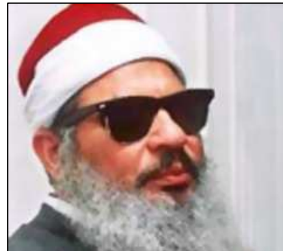
Omar Abdel Rahman

American diplomats and security officials are an additional target. In February 2009, another surfer in the Al-Faloja forum called for the Mujahideen in Somalia, Saudi Arabia and the Magreb region, to kidnap American diplomats or security officials worldwide and exchange them with Sheikh Omar Abdel Rahman, who has been incarcerated in the United States since 1993. 3