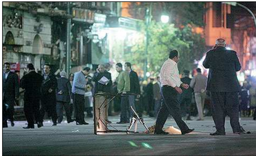
The site of the attack in Cairo

these sentiments and called for not harming innocent civilians. However, there were those who hinted that even innocent civilians – such as tourists, engineers, etc. – were a legitimate target, as they are perceived by Islam as infidels, as they breach Islamic values.