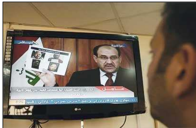
An Iraqi journalist watching the press conference of the Iraqi Prime Minister

The Iraqi Prime Minister, Nouri Al-Maliki, convened on April 19 th 2010 a press conference, announcing that Abu Omar Al-Baghdadi, leader of Al-Qaeda in Iraq, and Abu Hamza Al-Muhajir, the organization's "War Minister", were eliminated in a joint military operation of the Iraqi and American forces, carried out on April 18 th 2010 north of Bagdad. 2 A week later, on April 25 th 2010, Al-Qaeda in Iraq has confirmed that its two leaders were indeed killed. 3