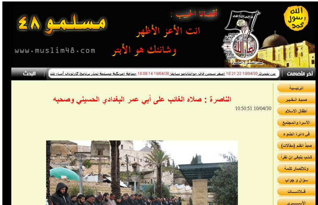
The article's headline as it appeared on the website

It should be noted that the report was quoted in one of the most prominent Jihadi forums in English, "Ansar Al-Mujahideen", 10 as well as in other Jihadi forums in Arabic. 11 On some of these forums it was said that the photograph of the prayer was taken on April 30 th 2010, 12 but other surfers doubt it, claiming the worshipers are seen in winter clothing while it is now spring. 13