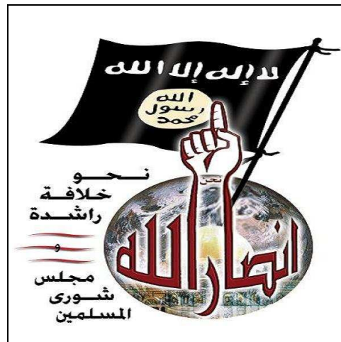
The logo of the organization

The website's banner depicts the Al-Aqsa Mosque, when on its left is the organization's logo and the inscription: "The beloved Al-Aqsa Mosque: you are the most dear and prominent and 'for he who hates you, he will be cut of (from posterity and every good thing in this world and in the Hereafter)'" [the last part of the sentence is taken from the Quran: Surah 108, Al-Kauthar 25 , verse 3].