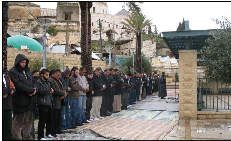
An archive photograph of a prayer at the Shahab Al-Din Mosque in Nazareth

A surfer at the "Al-Faloja" Jihadi forum adds a response to this report, stating that on April 28 th 2010, prayers were also conducted in East Jerusalem schools in memory of Al-Baghdadi and Al-Muhajir. 14