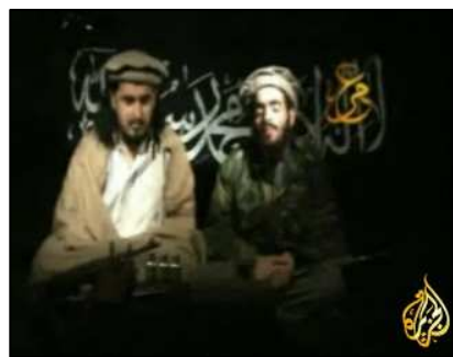
Al-Khorasani on the right, and on his left BaytAllah Mahsud's replacement, HakimAllah Mahsud