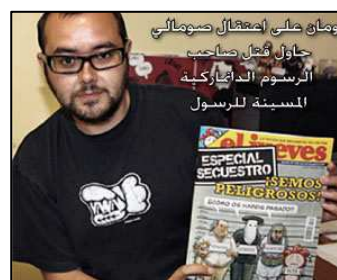
The Spanish magazine