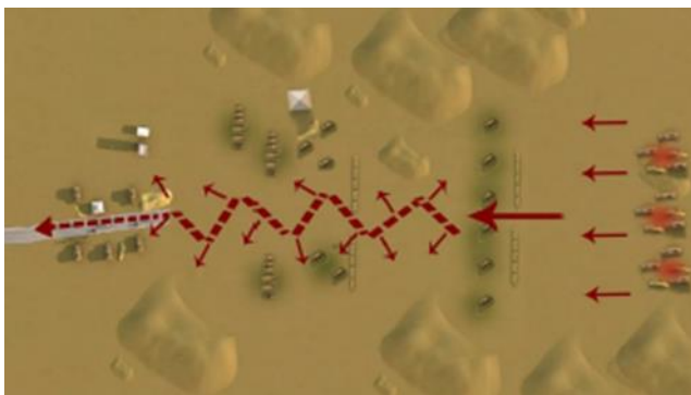
Fanning out of the troops