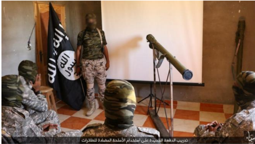
A class about IGLA by IS in Sinai Province