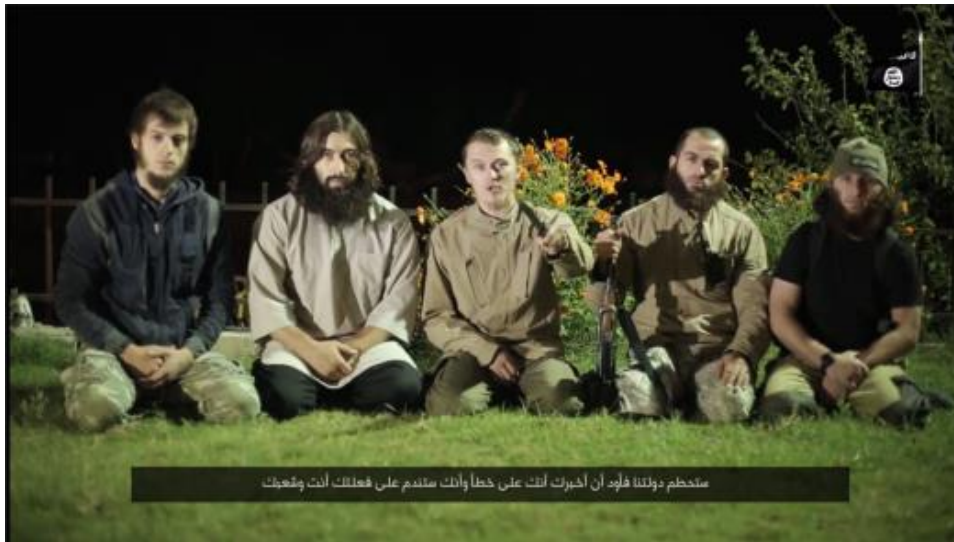
Sending warnings to Putin and Russia from Nineveh Province in Iraq

Aside from the discussions on the forum, the Islamic State’s official media branches addressed the incident in their other publications. The Islamic State media outlet in Nineveh Province in Iraq, for example, published a video titled “Downing the Russian plane to avenge our people in Syria”. In addition to footage of blessings and the distribution of sweets in celebration of downing the plane, at the end of the video five fighters appear. One of them sends warnings in Russian to Russia and Putin, while threatening to carry out terror attacks on Russian soil. 10