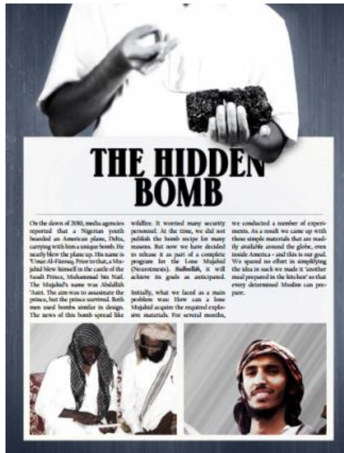
“The Hidden Bomb” (INSPIRE 13) as a means of downing civilian planes

It should be emphasized that the discourse about flight is not foreign to the forum, and posts on the subject can be found from past years. On December 27, 2014, for example, a forum member nicknamed abokhabab mentioned that the "hidden bomb" that appeared in issue 13 of INSPIRE (AQAP's English language online magazine) could be used by lone wolves "to down the civilian planes of apostates". 9