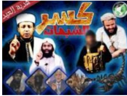
The video banner