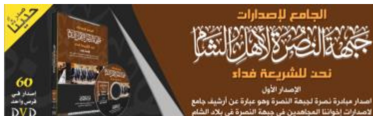
The banner of the online collection