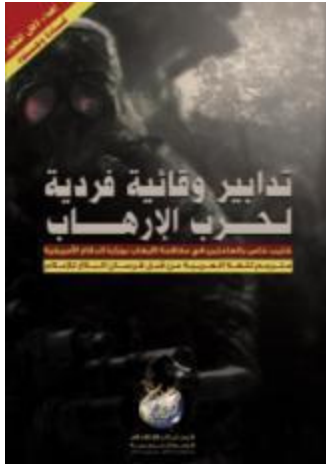
The title page of the translated pocket guide