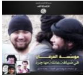
The video banner