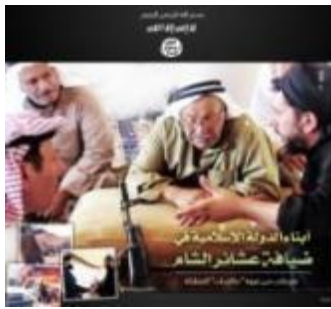
The video banner