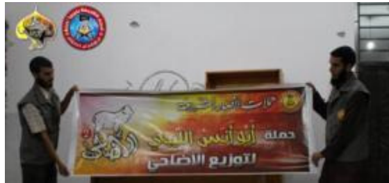
“The Abu Anas al-Libi delegation for the distribution of sacrificial offerings”