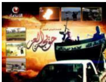
The video banner