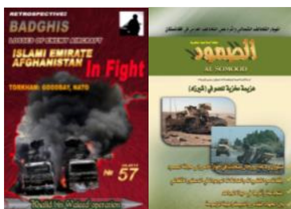
The covers of, from left to right, In Fight and Al-Sumud