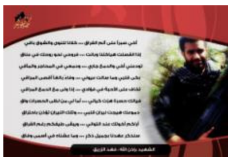
The banner in memory of al-Tamimi