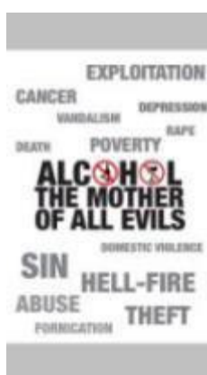
The banner that Anjem Choudary posted to his Twitter account condemning the consumption of alcohol

Choudary founded the al-Muhajiroun extremist group with the militant leader Sheikh Omar Bakri Muhammad. That group was banned in 2004, but has re-emerged under different names and in various guises. He also established the radical Islamist group Islam4Uk which was banned in 2010.