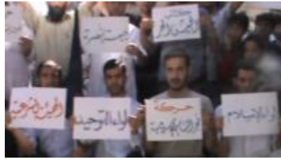
A photo of demonstrators in Aleppo