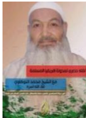
The photo of Sheikh Muhammad al-Nukawi that appears on the interview banner page