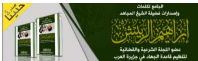
The anthology banner