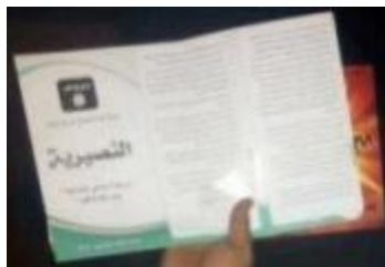
A photo of a pamphlet criticizing the Alawites, which was distributed by the Syrian rebels