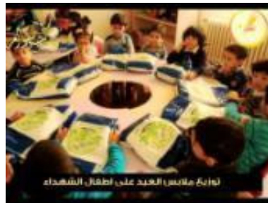
A photo of the children of martyrs in Syria posing with their gifts