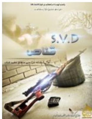
The title page of the guidebook