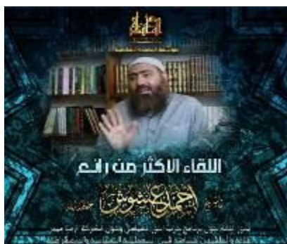
The portal to the interview with Sheikh Ahmad Ashush