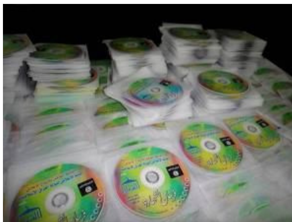
DVDs containing an anthology of Islamic State of Iraq publications