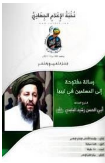
The opening of the video clip “An Open Letter to the Muslims of Libya”