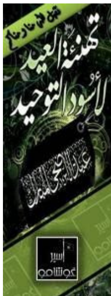
A graphic element from the Facebook page of "Assir Guantanamo"

content condemning Islamic legal scholars who express solidarity with Arab regimes. It also contains video clips eulogizing various Jihadist leaders, such as Osama Bin Laden. As of this writing, the page lists 1,360 friends. 57