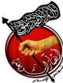
Ansar Al-Sharia's logo as it appears on its Facebook page