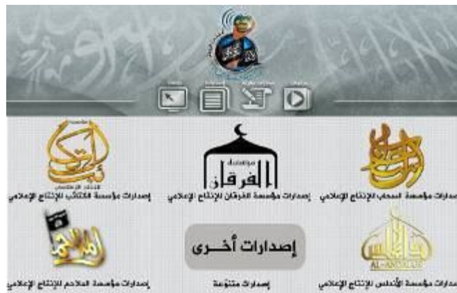
The portal to the anthology of Jihad