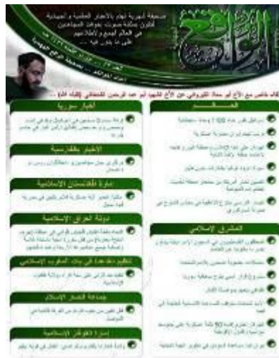
The opening page of the online Jihadi magazine, Al-Waqi'