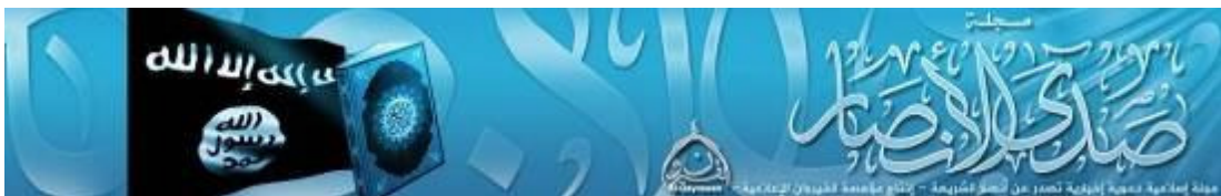
The logo of the new magazine Sada Al-Ansar as it appears on the blog. The left of the logo is occupied by the banner of Al-Qaeda and the logo of the Al-Qayrawan media outlet, which functions under the group's auspices