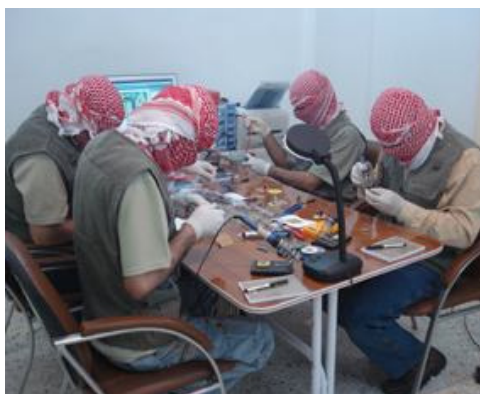
Mujahideen make a car bomb