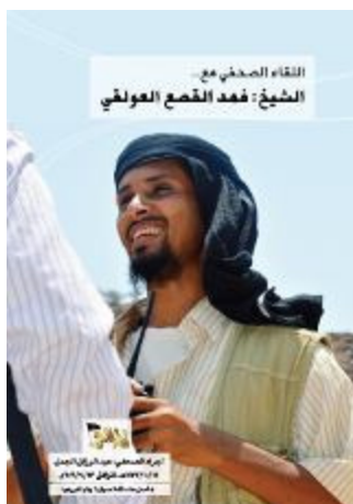
The cover of the interview with Sheikh Fahd Al-Qasana Al-Awlaki