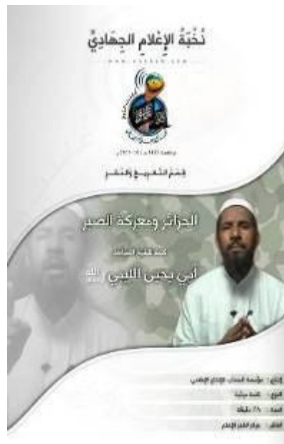
The opening of the video clip "Algeria and the Battle of Patience"