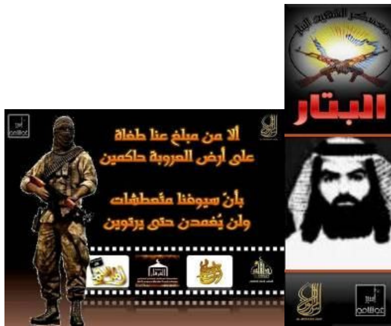
Graphic elements appearing on the Facebook page of "The Military Camp of Al-Battar the Martyr [Shahid]"