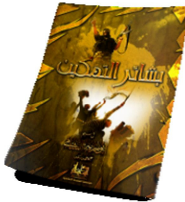
The cover of "In the Ranks of Success"