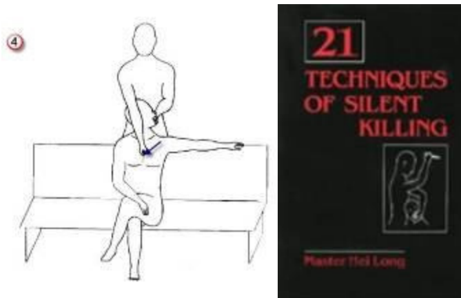
Illustrations from "We're All Lone Wolves"