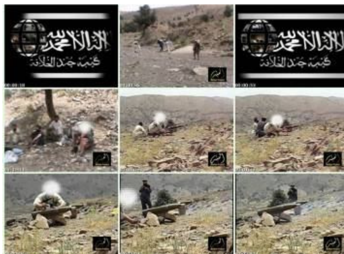
Scenes from the video clip produced by Minbar Project