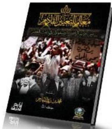
The cover of "Characteristics of Coming Change..."