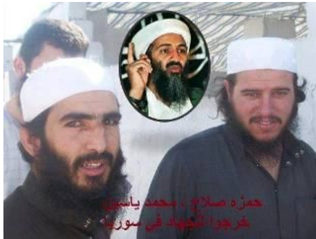
Two Tunisian mujahideen who have joined the jihad in Syria