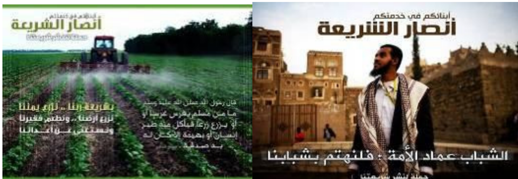
Two of the banners praising Ansar Al-Sharia, which have recently been posted on jihadist Web forums