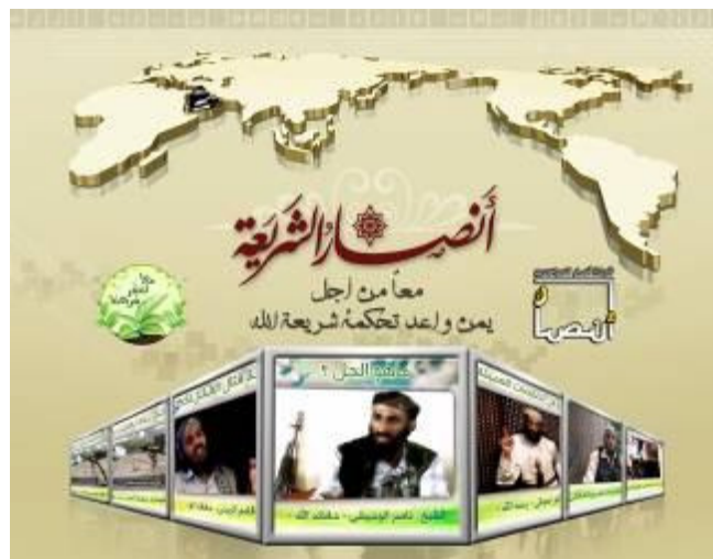
A video clip published by the jihadist Web forum Ansar Al-Mujahideen