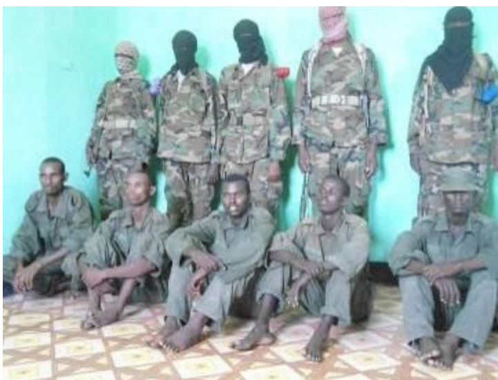
Five Somali soldiers who turned themselves in to members of Al-Shabab Al-Mujahideen