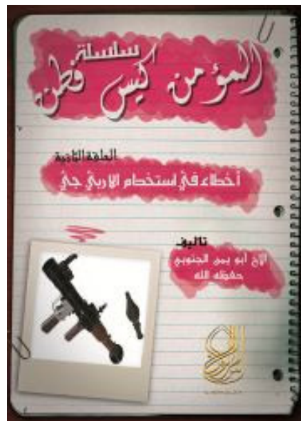
Common errors in firing RPGs