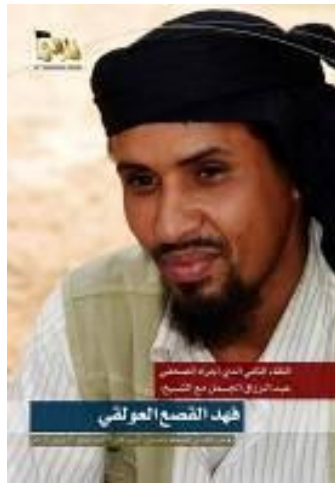
Fahd Al-Quso Al-Awlaqi