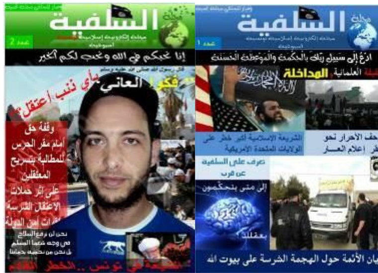
The covers of the first two issues of the Tunisian Salafi-jihadist weekly Majlat Al-Salafiyya , which appears on Facebook