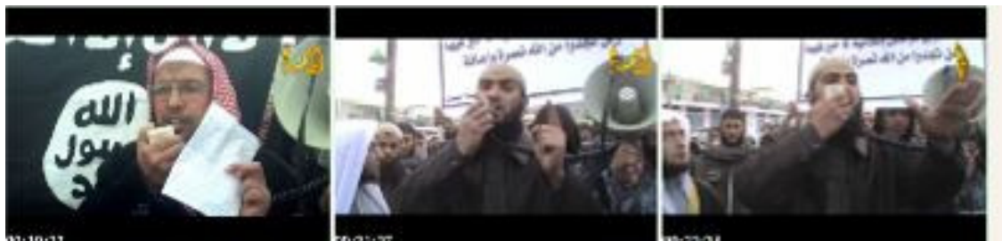
Scenes from a Salafi-jihadist rally in the Gaza Strip