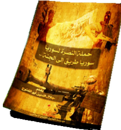
Syria as the road to paradise

pressure other regimes to sever their ties with the Syrian regime; boycott goods from countries that support the Syrian regime, especially Iran, Russia and China; expose the true face of Syrian agents, especially Sunnis, who grant legitimacy to the Syrian regime. 48