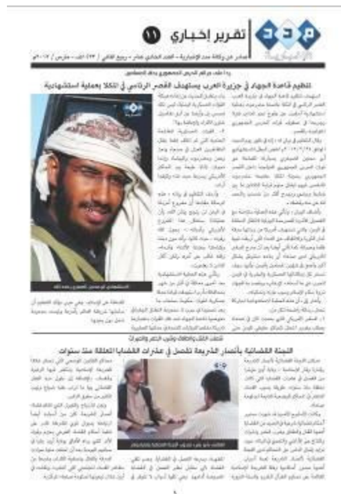
Madad Newsletter Number 11