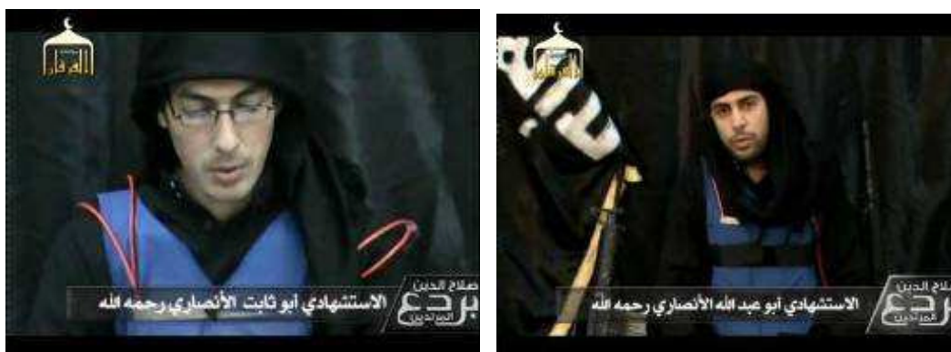
The two terrorists

attack, the council building was demolished and scores of Shiites who were inside were either killed or injured. The two terrorists who carried out the attack penetrated the council building disguised as soldiers and managed to take some of the employees hostage. Both were killed in the exchange of fire between them and Iraqi government and American forces.