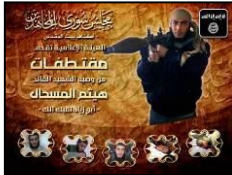
The martyr Haytham al-Mushal