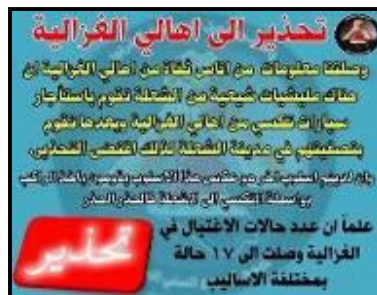
A banner warning Sunni residents of the Ghazaliyah neighborhood of Baghdad against the attacks of Shi’ite militias