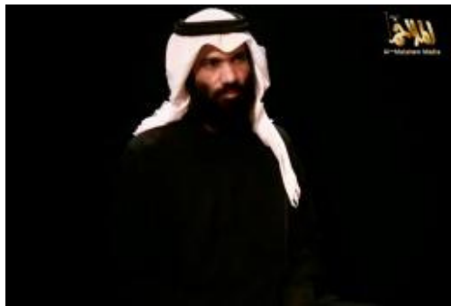
The kidnapped Saudi diplomat Abdallah al-Khalidi