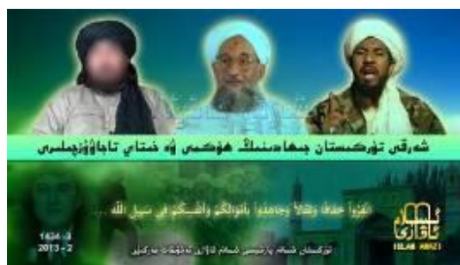
An advertisement for a video clip about the “Chinese aggressor”