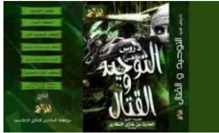
The banner for the series of audio statements