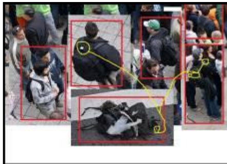
How US authorities traced potential perpetrators of the Boston Marathon attack