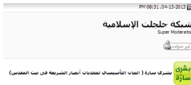
From an announcement of the launching of a new jihadist Web forum