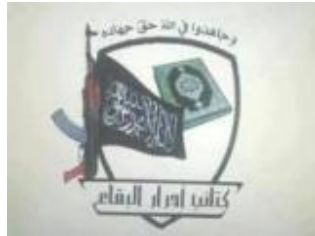
The logo of Ahrar Al-Baqa'

interfering in Lebanon in any way – even if this meant moving the battle to Lebanon itself. 27