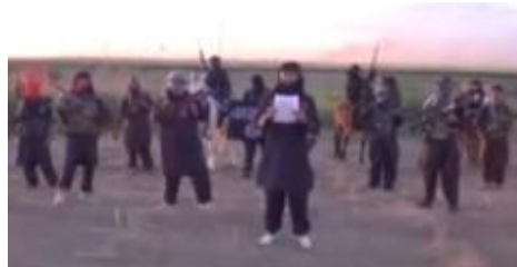
From a video clip declaring the establishment of the Taliban in Al-Sham