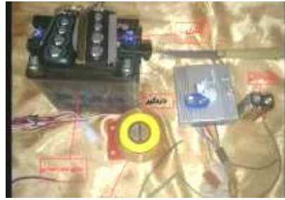
The components for constructing an IED