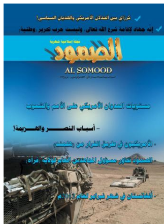
The cover of Issue 85 of Al-Somood