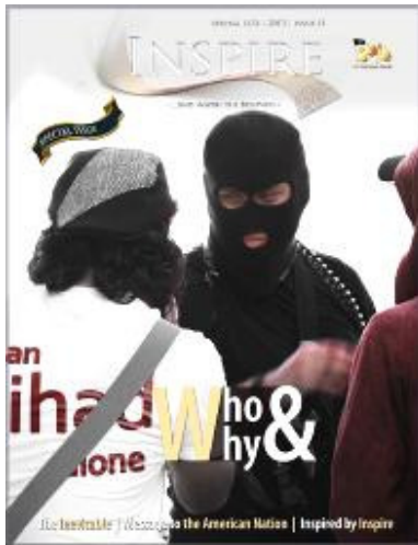
The cover of Issue No. 11 of Inspire

It is worth noting that Issue No. 11 appeared soon after Issue No. 10, which was published in March 2013. The atypical and relatively rapid publication of these two issues may have been due to the Marathon bombings in Boston and the murder of Drummer Lee Rigby in London. As the editor's comments clearly indicate (see illustration), Issue No. 11 is dedicated to an iteration of the vulnerability of the West, especially the US, to attack by adherents of global jihad the message of Al-Qaeda.