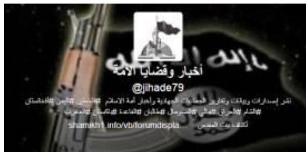
The announcement of a new Twitter feed covering jihad in the Sinai Peninsula