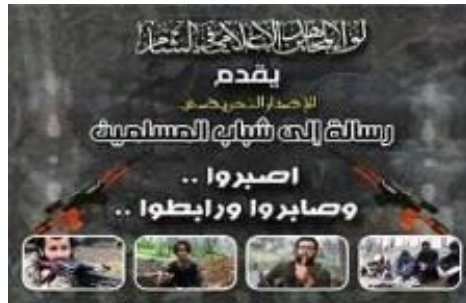
The banner advertising the videotaped interviews

fighting jihad outside their country of origin. The visitor, who may have known some of the emigrant fighters personally, noted that he missed them and the sound of gun- and mortar fire. 26