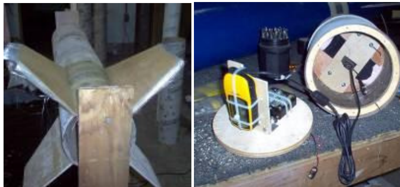
An illustrated guide to building an aestus hybrid rocket