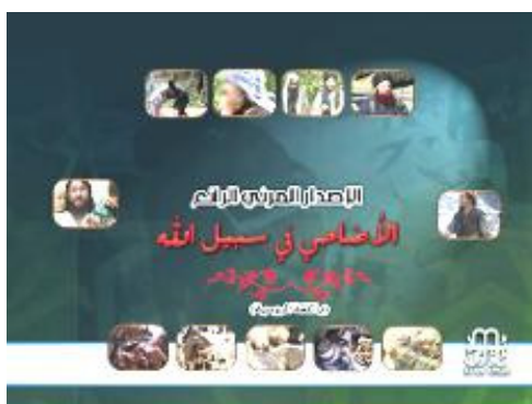
An advertisement for a video clip published by the TIP