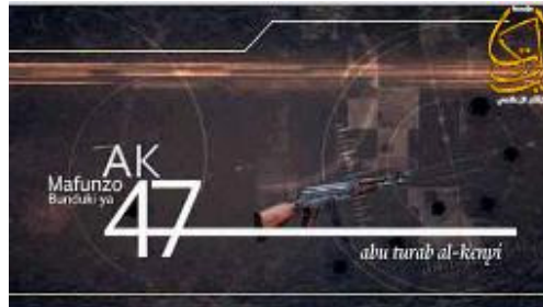
A video guide to firing an AK-47