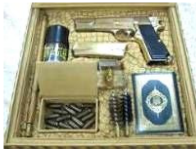
Among the light weapons being used by mujahideen in Iraq. Note that a Qur'an is in the bottom right-hand corner of the weapons kit.