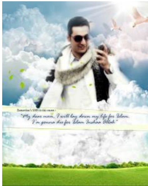
An inside page of Inspire lauding Tamerlan Tsarnaev, who was killed during the manhunt for the Boston Marathon attackers