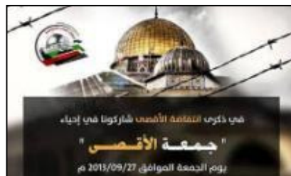
The announcement banner