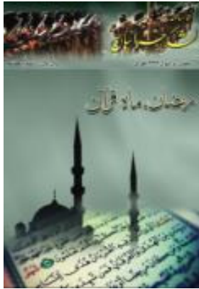
The banner of the seventh issue of the jihadist magazine, Lashkari Khurasan