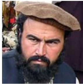
Waliur Rehman Mehsud

leader of the organization in southern Waziristan and as a senior strategist. He was also considered a possible successor for the organization's leadership. According to the organization, the military base that was attacked served as a base of departure for military attacks against the mujahideen, and against Muslims in Waziristan and in tribal areas. According to the announcement, four mujahideen participated in the attack, during which they broke into the army base at midnight using hand grenades and explosive belts. 10