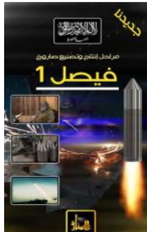
The video banner