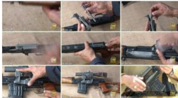
Clips from instructional video No. 7