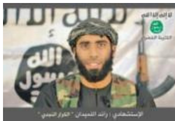
The video banner