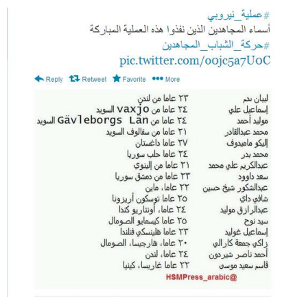
The alleged list of participants in the terrorist attack