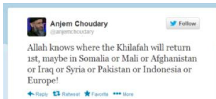
Anjem Choudary’s post on his Twitter account