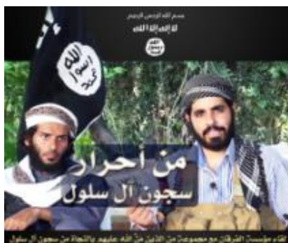
The video banner