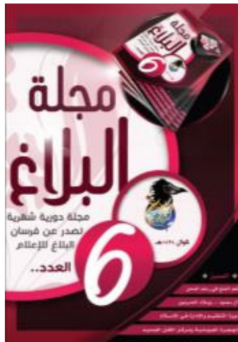
The banner page of the Al-Balagh jihadist magazine