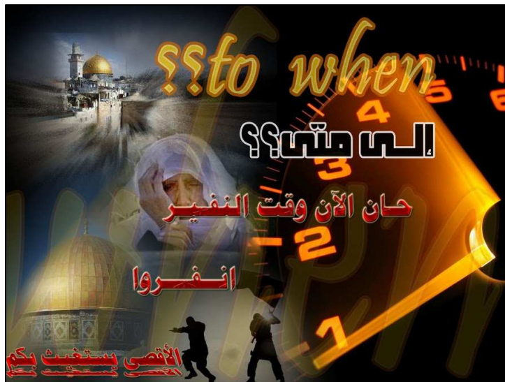
A pamphlet calling for Jihad to save the Al-Aqsa Mosque