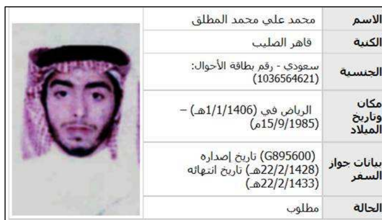
Details of one of the surfers and his photograph as it appears on the Saudi Ministry of Interior website