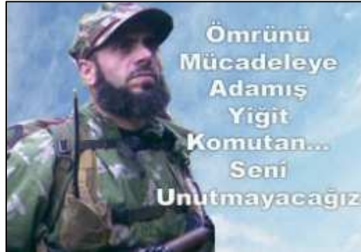
"A brave leader and a man who dedicated his life to the struggle... we will not forget you"