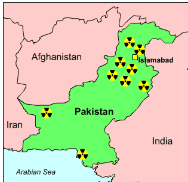
Pakistan's nuclear installations

An attack on the nuclear missile storage facility at Sargodha on November 1, 2007; an attack on Pakistan's nuclear airbase at Kamra by a suicide bomber on December 10, 2007; and perhaps most significantly the August 20, 2008 attack when Pakistani Taliban suicide bombers blew up several entry points to one of the armament complexes at the Wah cantonment, considered one of Pakistan's main nuclear weapons assembly sites".