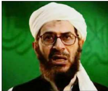
Mustafa Abu Al-Yazid

"God willing, the nuclear weapons will not fall into the hands of the Americans and the Mujahideen would take them and use them against the Americans".