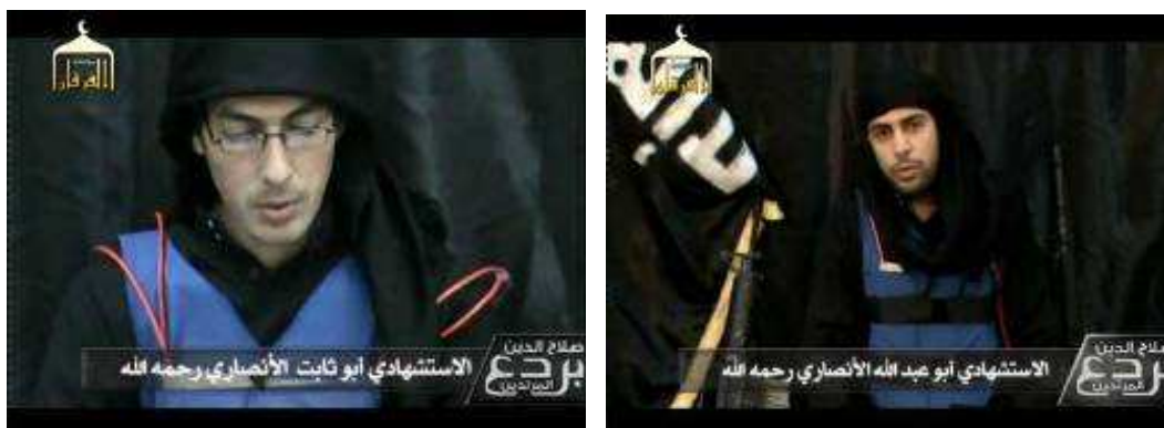
The two terrorists

attack, the council building was demolished and scores of Shiites who were inside were either killed or injured. The two terrorists who carried out the attack penetrated the council building disguised as soldiers and managed to take some of the employees hostage. Both were killed in the exchange of fire between them and Iraqi government and American forces.