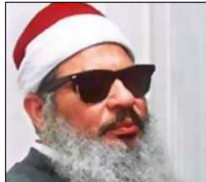
Omar Abdel Rahman

American diplomats and security officials are an additional target. In February 2009, another surfer in the Al-Faloja forum called for the Mujahideen in Somalia, Saudi Arabia and the Magreb region, to kidnap American diplomats or security officials worldwide and exchange them with Sheikh Omar Abdel Rahman, who has been incarcerated in the United States since 1993. 3